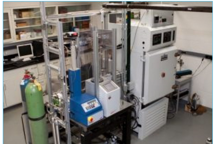
Figure 1: NETL Phase and Composition Analysis Laboratory, Pittsburgh, PA.

The EOS research team developed a novel approach for reservoir fluids densities based on group contributions and the perturbed-chain statistical associating fluid theory (PC-SAFT). Implementation of this predictive method in reservoir simulators could substantially improve density predictions over the complete range of temperature and pressure encountered in ultradeep reservoirs.