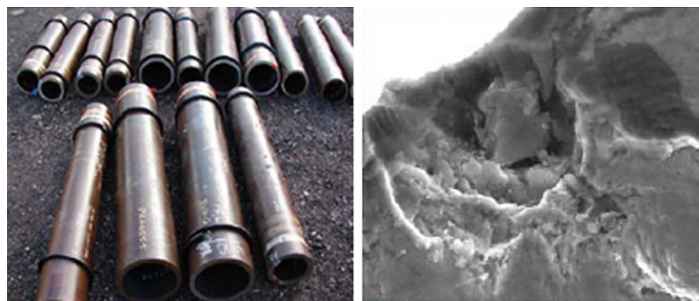
Figure 2. The most commonly used alloys in offshore drilling operations are being evaluated in NETL metal corrosion studies.

This project seeks to identify the failure mechanisms and rates of material degradation for critical components in offshore drilling by basing determinations on observed/reported behavior in the field. However, as there is limited publicly available data on the performance of these materials under extreme offshore conditions, the study will be augmented with experimental research on materials performance under simulated extreme conditions. To date, this study has successfully evaluated the strength/corrosion potential of the most common alloys used in extreme offshore drilling under in situ conditions (pressure, temperature, hydrogen sulfide, etc.). Work is ongoing in the development of a pit/fatigue model for the assessment of catastrophic failure potential of these metallic components. The U.S. Department of Energy's National Energy Technology Laboratory is also evaluating new alloys (e.g., nickel-based alloys as a structural material or as a cladding onto steel) and surface treatments (e.g., hammer peening) for ultra-deep well environments. These findings are presented in the document, Fatigue Crack Growth Rate of UD-165 in Sour Environments .