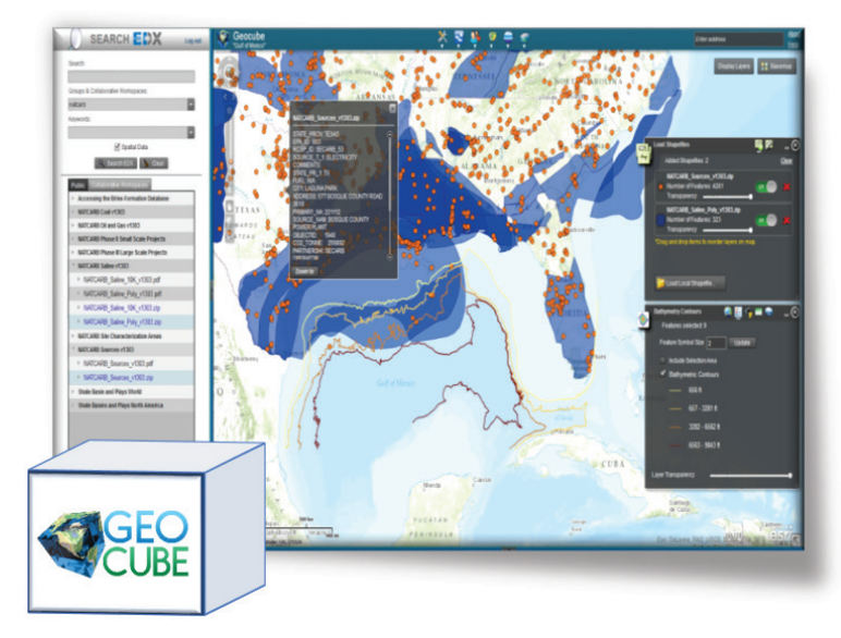
Screen shot of Geocube tool. Geocube allows users to map spatial data hosted within EDX and from external sources as well.