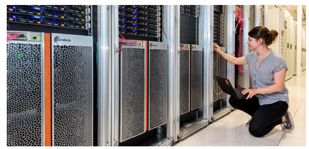
NETL and Cerebras have signed an agreement in which NETL is developing the WFA and Cerebras is running tests on their hardware cluster pictured here.

This paradigm shift in computing enabled by NETL's WFA has the potential to revolutionize much of the lab's critical decarbonization research. Currently, the research team is working to use the WFA to develop a finite volume computational fluid dynamics solver, which will help design future energy systems in far less time and at reduced monetary and energy costs. In the future, the WFA could branch out into areas such as geodynamics, geomechanics, molecular dynamics and structural dynamics.