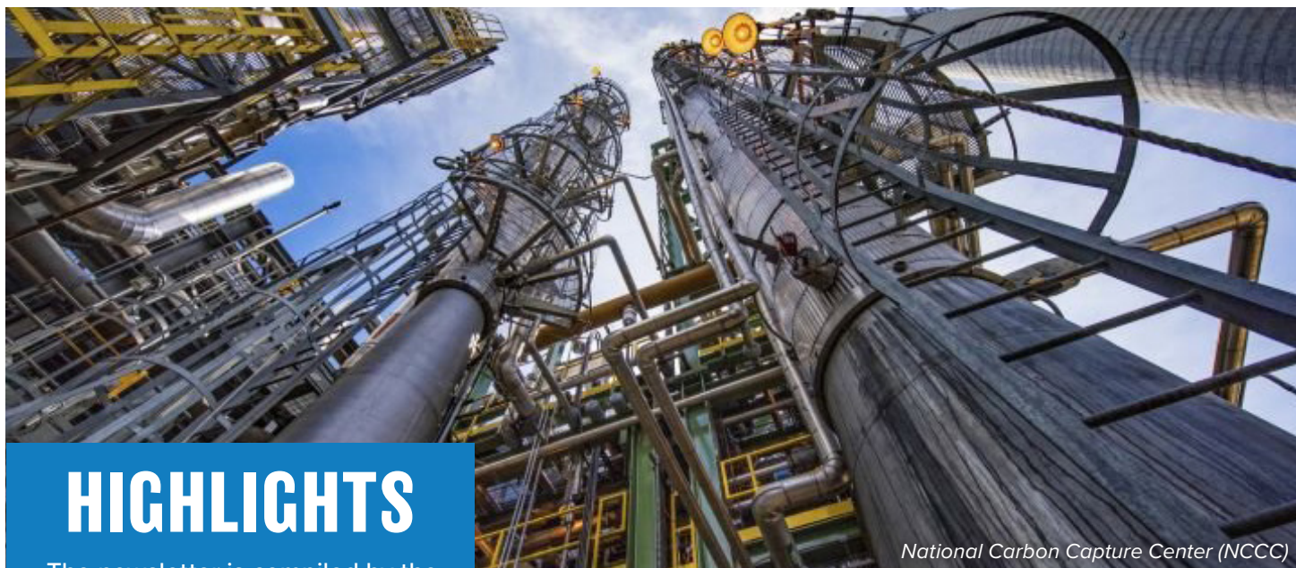
National Carbon Capture Center (NCCC)

U.S. DEPARTMENT OF ENERGY | OFFICE OF FOSSIL ENERGY | NATIONAL ENERGY TECHNOLOGY LABORATORY