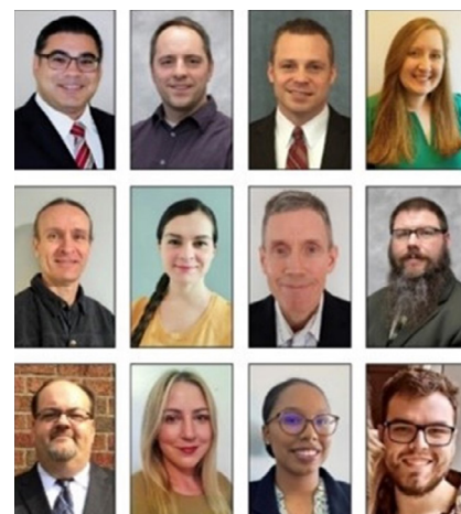
NETL's Carbon Capture Team