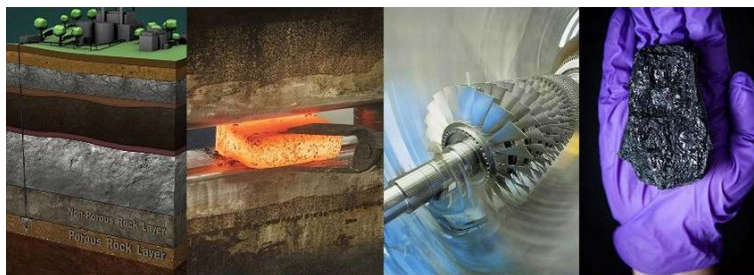
2020 INTEGRATED PROJECT REVIEW MEETING

A series of free virtual sessions organized by the U.S. Department of Energy (DOE) and the National Energy Technology Laboratory (NETL) commenced with a three-day conference on carbon capture, utilization, and storage (CCUS) on August 17, 2020. Over a 12-week period, the 2020 Virtual Integrated Project Review Meeting will feature projects from several DOE Office of Fossil Energy (FE) portfolios, including Carbon Capture, Carbon Storage, and Carbon Utilization. Sessions focus on how DOE/FE-sponsored research and development (R&D) activities are advancing transformative science and technologies to support efficient and environmentally sound use of fossil fuels. A comprehensive schedule of the integrated virtual meeting, which will run through November 2020, is available online . From NETL News Release . August 2020.