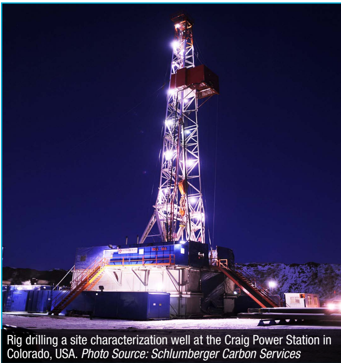
Rig drilling a site characterization well at the Craig Power Station in Colorado, USA.

Newsletters, program fact sheets, best practices manuals, roadmaps, educational resources, presentations, and more information related to the Carbon Storage Program is available on DOE's Energy Data eXchange (EDX) website .