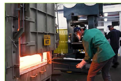
NETL research site in Albany, Oregon (USA).

NETL released a series of "Get to Know NETL" videos highlighting work being conducted at NETL facilities. The series includes an overview of NETL as well as videos about NETL sites in Albany, Oregon; Morgantown, West Virginia; and Pittsburgh, Pennsylvania.