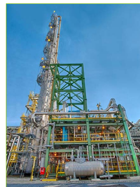
Petra Nova site, located near Houston, Texas (USA).

A document released by DOE's National Energy Technology Laboratory (NETL) highlights 20 years of DOE/NETL carbon capture and storage (CCS) R&D. The document, titled " Safe Geologic Storage of Captured Carbon Dioxide: Two Decades of DOE's Carbon Storage R&D Program in Review ," details the role played by DOE's Regional Carbon Sequestration Partnership (RCSPs) Initiative , as well as the CarbonSAFE Initiative. An excerpt from the Executive Summary can be found in the Publications section of this newsletter. From energy.gov . April 2020.