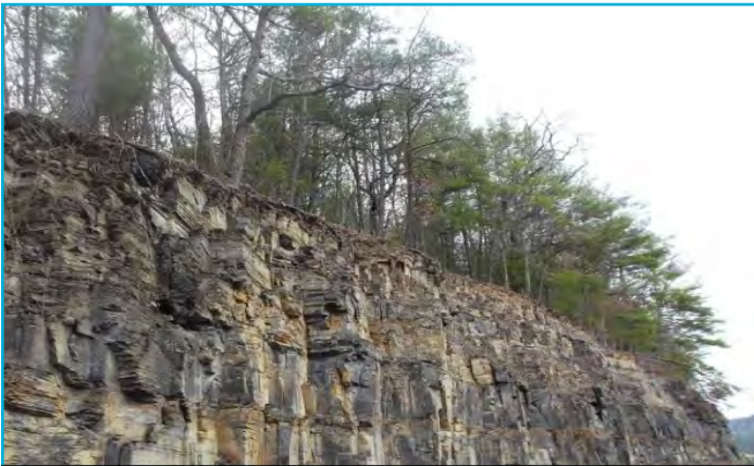
Parallel, vertical, orthogonal natural fracture faces (joint sets) in an outcrop of organic-rich Millboro Shale (Marcellus equivalent), Clover Creek, VA.

Newsletters, program fact sheets, best practices manuals, roadmaps, educational resources, presentations, and more information related to the Carbon Storage Program is available on DOE's Energy Data eXchange (EDX) website .