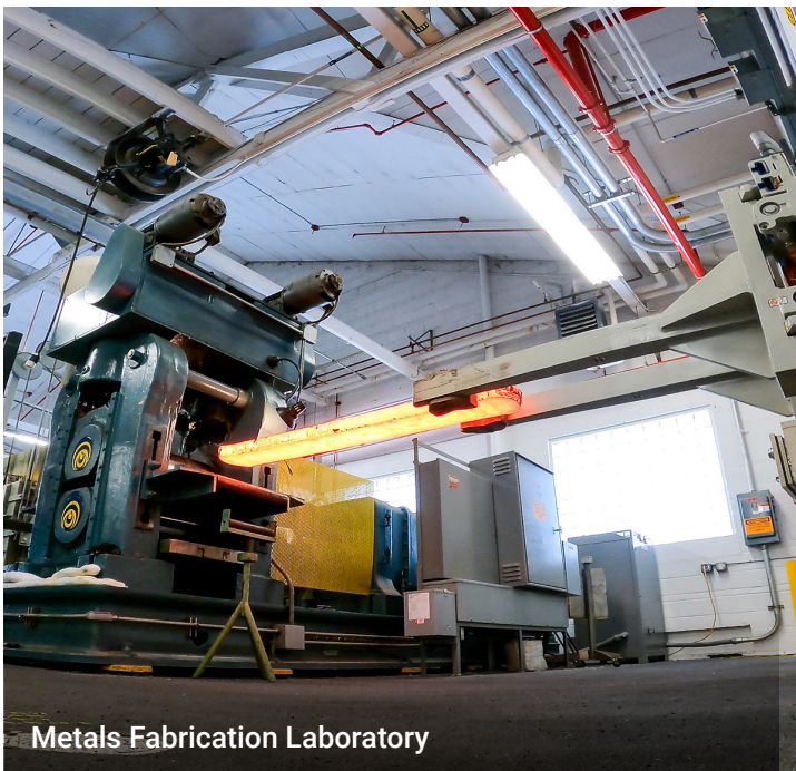
Metals Fabrication Laboratory