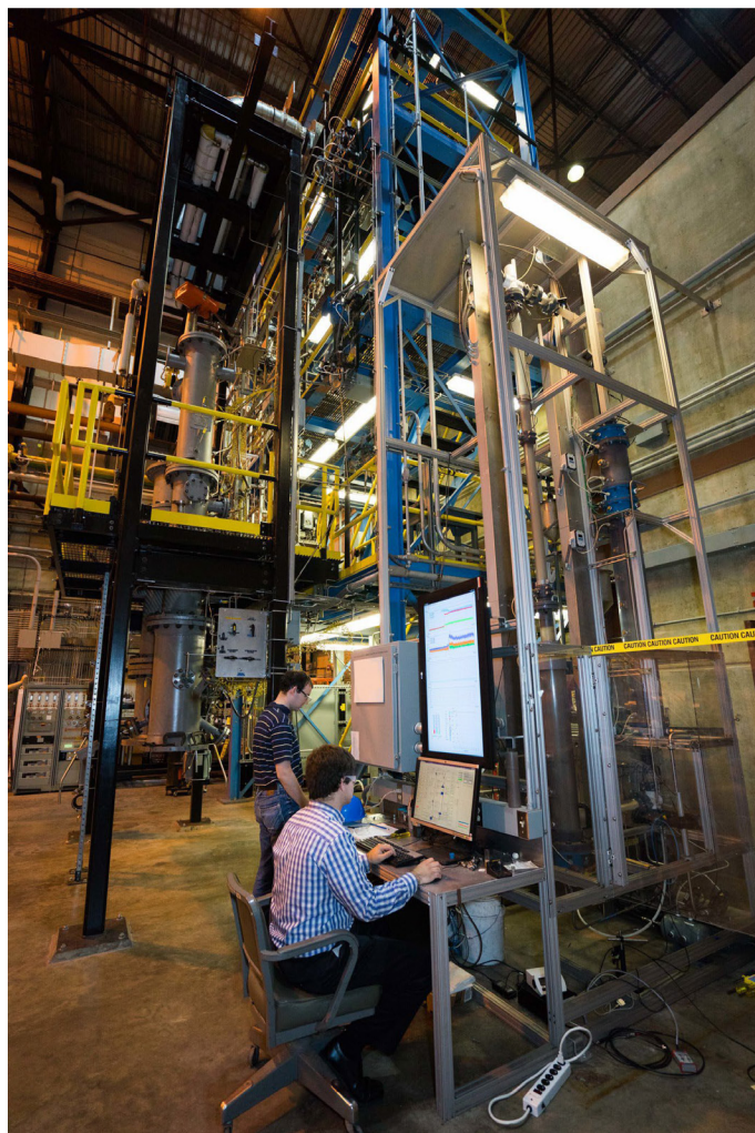
Researchers at work in the chemical looping reactor at the NETL site in Morgantown, W.Va.

https://netl.doe.gov/business/partnerships