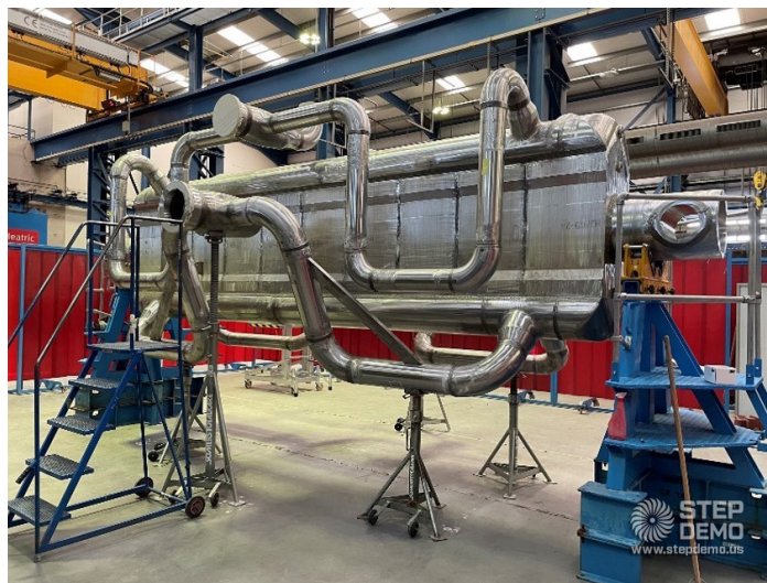
Figure 4. High Temperature Recuperator fabricated by Heatriac for the 10 MWe STEP Pilot Plant Test Facility

The Supercritical Carbon Dioxide Technology Program R&D work described above is closely coordinated with the STEP program. The Office of Fossil Energy and Carbon Management leads the STEP program and is part of a Department of Energy-wide collaboration with the Offices of Nuclear Energy, and Energy Efficiency and Renewable Energy, which leverages the capabilities and interests of these organizations toward the development of supercritical CO 2 power cycles. The mission is to demonstrate a lower cost of electricity with supercritical CO 2 power cycles as applied to nuclear, concentrated solar, and fossil fuel heat sources. To support this mission, the main objective of the STEP program is to build and operate a 10-MWe supercritical CO 2 power cycle test facility for evaluating power cycle and component performance over a range of operating conditions at a relevant scale.