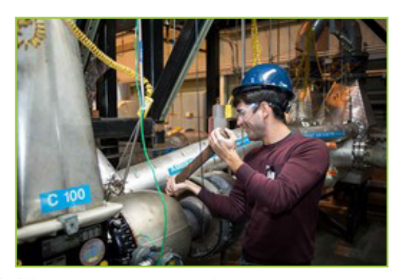
U.S. Offshore Wind Energy Workforce Assessment