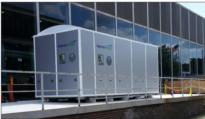
FIGURE 2. FuelCell Energy 200 kWe Prototype System.

Additional information may be found on NETL's Solid Oxide Fuel Cell web page.