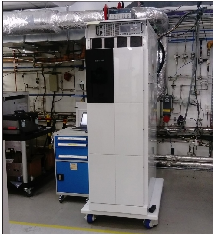
FIGURE 3. Cummins/Ceres Power 10 kWe SOFC System.