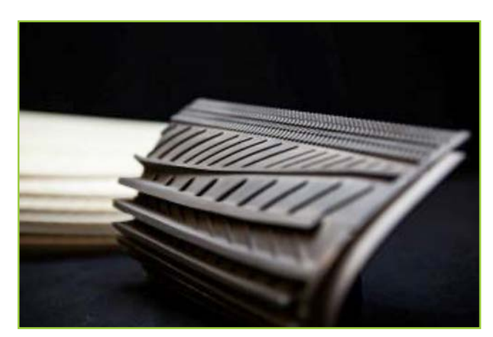
NETL and Partners Team Up to Advance Turbine Technology

A cooperative partnership with NETL is advancing the development of next-generation gas turbines to perform with greater efficiency and at higher temperatures to meet the nation's energy needs while generating cleaner power. Since 2011, the Steady Thermal Aero Research Turbine Lab at Penn State University has progressed from a floor plan into a world-class testing facility capable of simulating realistic turbine operating conditions, thanks in large measure to support from NETL and the U.S. DOE's Office of Fossil Energy. Other