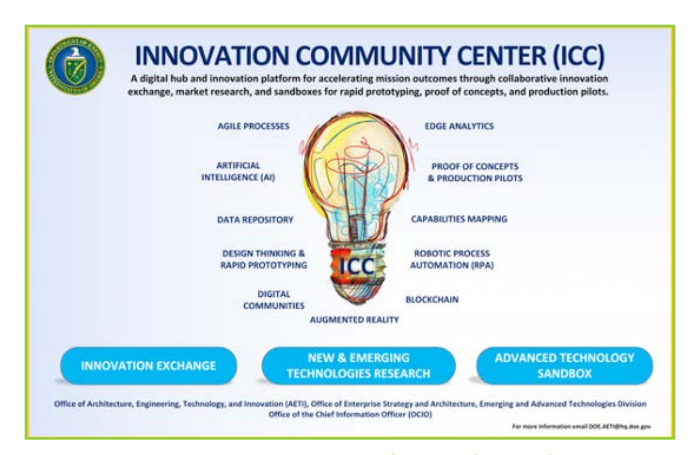
Your Digital Lab Awaits: Why You Should Check Out the Innovation Community Center

The wind industry needs a broad range of workers, including turbine engineers, project developers, and supply chain managers, to support growth in wind. Unfortunately, employers report difficulty hiring well-qualified candidates to support this growth while graduates have also had difficulty finding jobs. That's why the U.S. DOE's Collegiate Wind Competition organizing team called together a panel of competition alumni and wind industry professionals to provide helpful tips and tactics for breezing into a job in wind power.