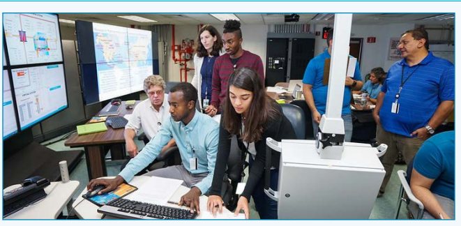
Workforce Development in Emerging Fields

Department of Energy, Deadline, April 13, 2020