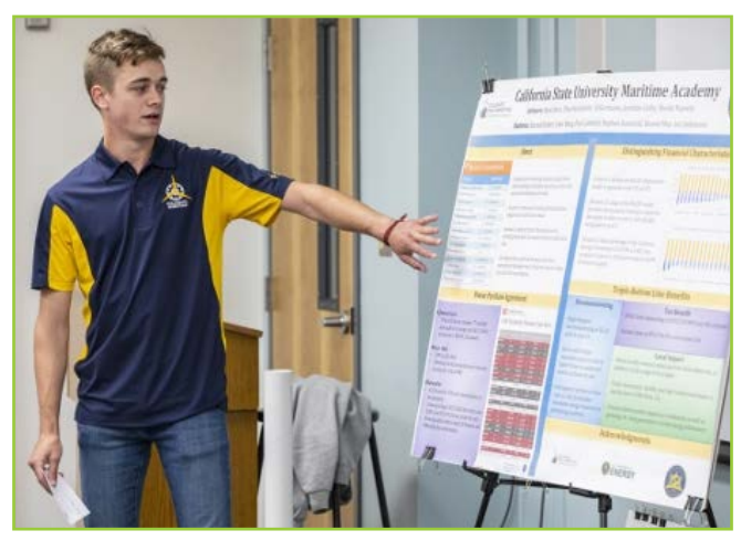
Wind Energy Professionals Share Tips for Breezing into the Wind Workforce

Utah's motto is "Life Elevated" and the Governor's Office of Energy Development has readily applied this to their STEM outreach. The Office of Energy Efficiency and Renewable Energy funds work, via a formula grant from the State Energy Program, to support the Utah Power and Energy Career Expo and assist teachers with energy literacy and classroom activities.