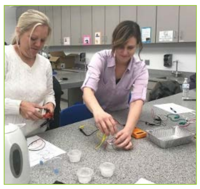
Life — and STEM — Elevated in Utah

Utah's motto is "Life Elevated" and the Governor's Office of Energy Development has readily applied this to their STEM outreach. The Office of Energy Efficiency and Renewable Energy funds work, via a formula grant from the State Energy Program, to support the Utah Power and Energy Career Expo and assist teachers with energy literacy and classroom activities.