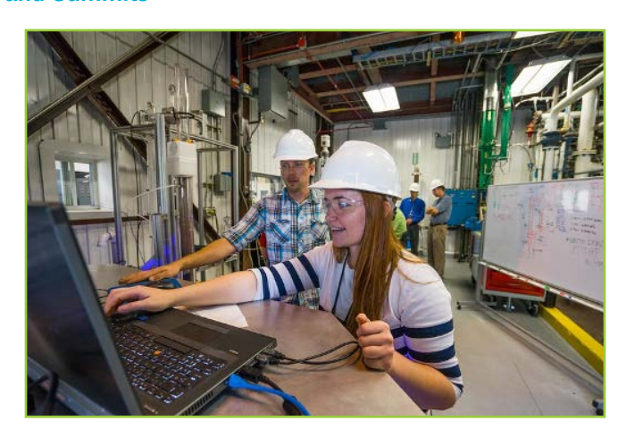
NETL RWFI — Energy 101 Webinar Invitation — High Performance & Advanced Materials

Tuesday, April 7, 2020, 11:00 a.m.-12:00 p.m.