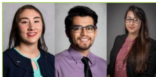
NETL Technical Forum Spotlights Research of DOE's Consortium for Integrating Energy Systems in Engineering and Science Education (CIESESE) Program

Six college students and two professors, who participated in a mentored training program at NETL sponsored by DOE and designed to encourage pursuit of careers in energy industries, presented the results of their summer research projects during a technical forum held this week in Morgantown, West Virginia. The individuals were participants in (CIESESE) — a program that supports DOE's goal of building a continuing cadre of professionals, particularly from the Hispanic community, who are ready to take on the challenges of new energy systems — the infrastructure, technologies, and procedures used to generate, store, and distribute energy.