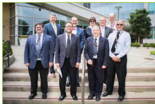
Texas Tech Petroleum Engineers Visit NETL to Learn about Lab's Permian Basin Research

Six college students and two professors, who participated in a mentored training program at NETL sponsored by DOE and designed to encourage pursuit of careers in energy industries, presented the results of their summer research projects during a technical forum held this week in Morgantown, West Virginia. The individuals were participants in (CIESESE) — a program that supports DOE's goal of building a continuing cadre of professionals, particularly from the Hispanic community, who are ready to take on the challenges of new energy systems — the infrastructure, technologies, and procedures used to generate, store, and distribute energy.