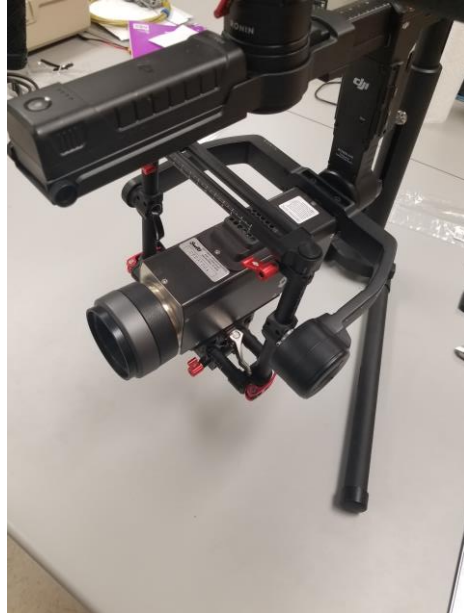
Figure 2. Ronin gimbal outfitted with an OGI camera; the gimbal allows for controlled omnidirectional pointing of the camera