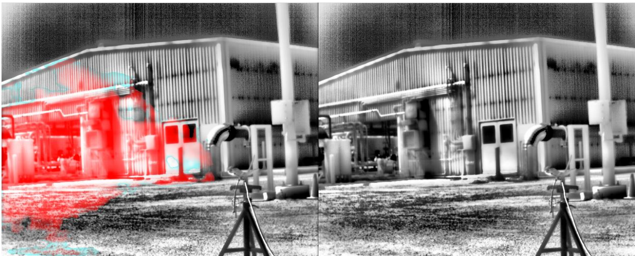
Figure 1: A live methane plume detection using the embedded SLED/M algorithm on a very noisy background.