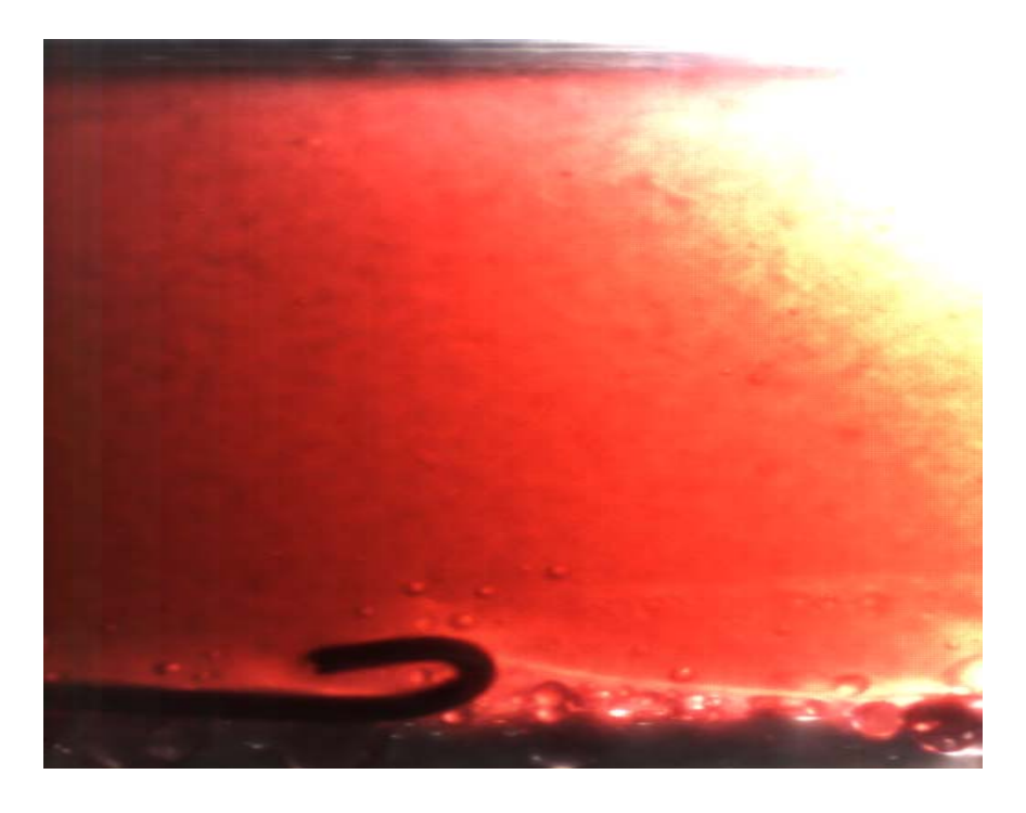
Figure 8: Dispersion of Water in Oil Under Oil Layer.