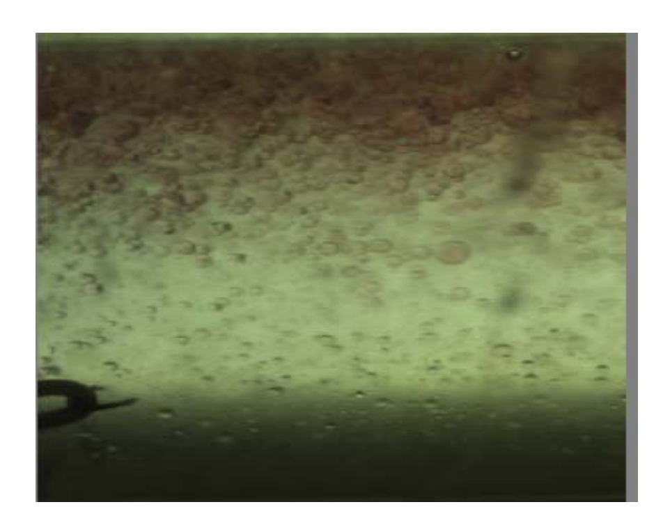
Figure 3: Dispersion of Oil in Water Over Water Layer