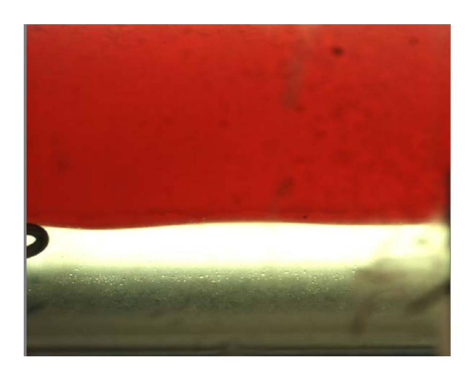
Figure 1: Stratified Flow