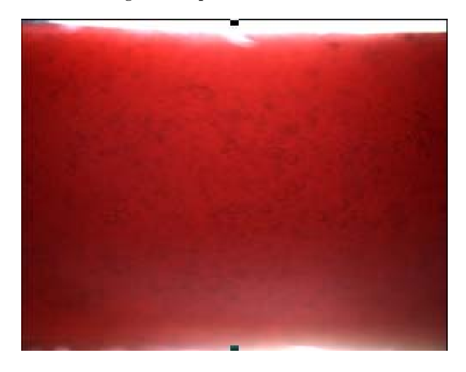
Figure 6: Dispersion of Water in Oil.