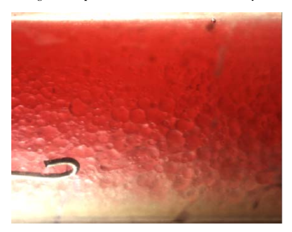
Figure 4: Dual Dispersion (Dispersion of Oil in Water and Dispersion of Water in