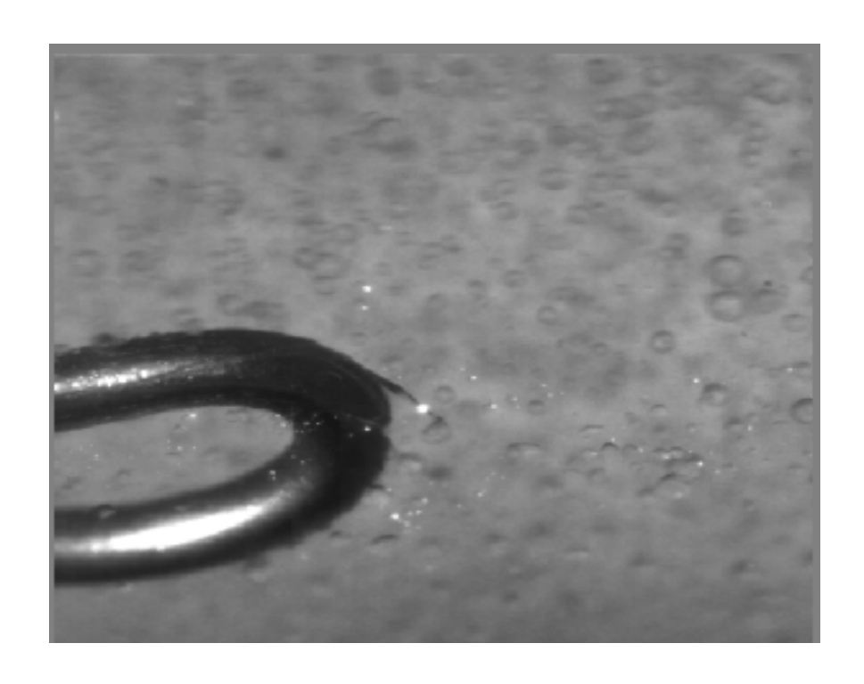
Figure 5: Dispersion of Oil in Water.