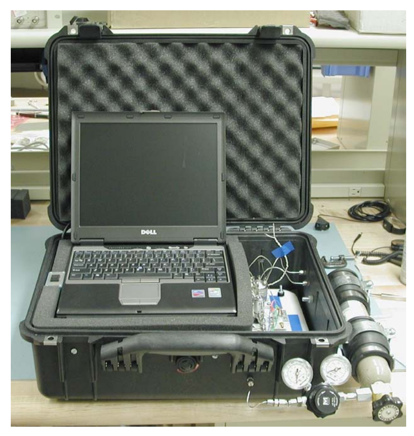
Figure 3. Field-portable natural gas analysis instrument. An air tank with 2 cubic feet capacity straps to the side of the instrument. Chromatography hardware is visible to the right of the computer. Electronics boards are located under the computer. LabVIEW program on computer controls instrument and acquires data. A 12VDC battery or 120VAC is required.