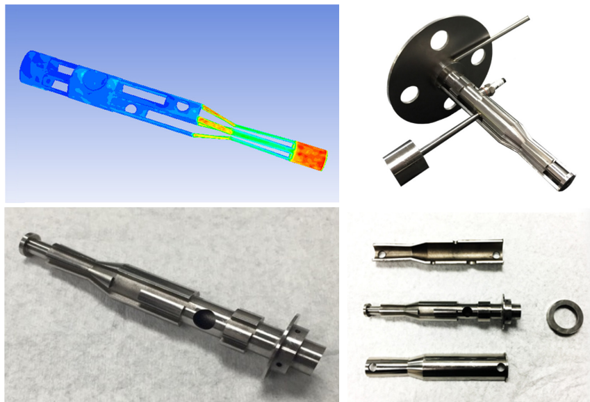
Direct power extraction combustor designed using computational tools to operate on methane and oxygen.

Direct Power Extraction (DPE) refers to the direct conversion of the thermal or kinetic energy in a fluid to useable electrical power. By avoiding an intermediate mechanical energy conversion step (e.g., the movement of turbine blades) power generation efficiencies can be extended beyond the current state of the art. This is because theoretical maximum cycle efficiencies are limited by the maximum cycle temperature in accordance with Carnot’s rule, and turbine blades are one of the limiting factors in extending the temperatures of turbo-machinery.