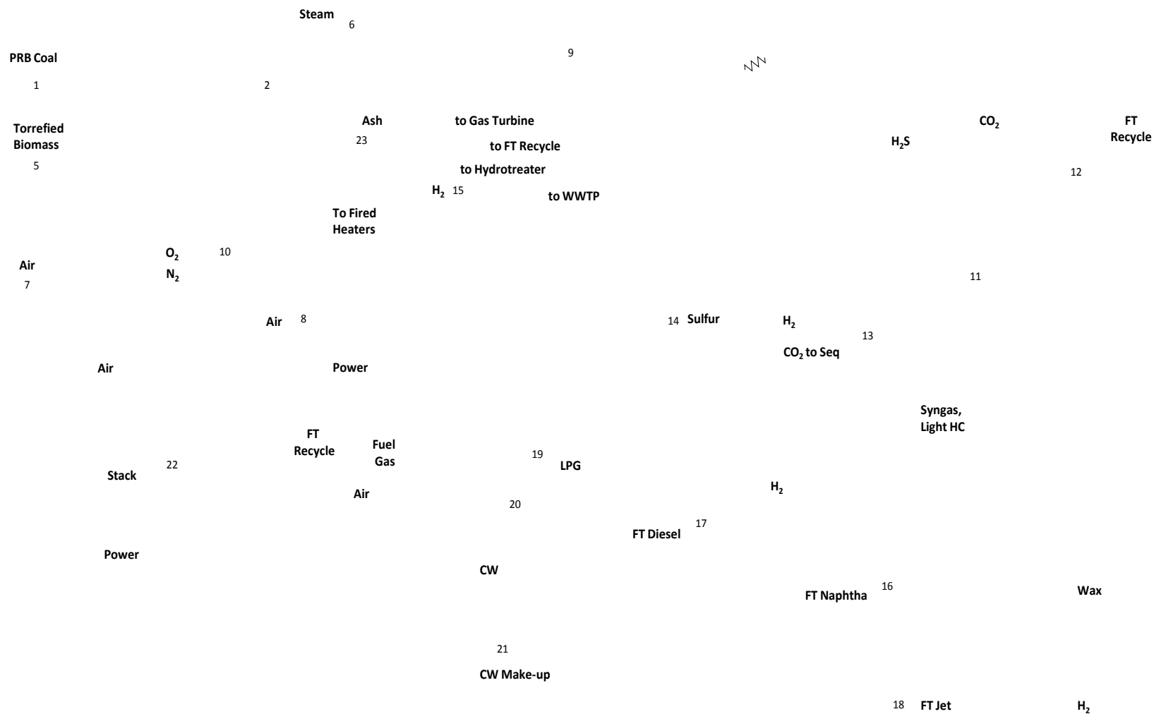
Figure 1: CBTL, 20% Torrefied Biomass, Facility Configuration