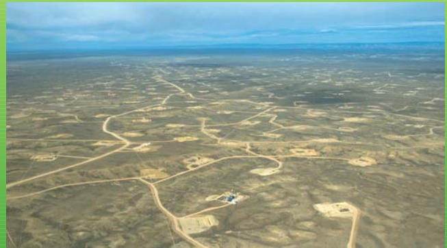
An aerial view of Jonah field in Wyoming. The well pads are small and compact in the development area, which has seen a natural gas boom since the 1990s.

Many of these techniques for low-impact operations are derived from lessons learned from Alaskan North Slope experience and enhanced technology.