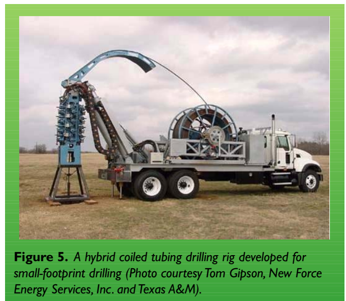
Figure 5. A hybrid coiled tubing drilling rig developed for small-footprint drilling (Photo courtesy Tom Gipson, New Force Energy Services, Inc. and Texas A&M).

greatly reduced—making smaller holes possible, reducing environmental impacts, and lowering costs. Dual-gradient drilling systems have been developed that will reduce bottomhole pressures. Innovations of drilling equipment include development of retractable bits and motors, long-life bits, and drilling systems that allow drilling with casing. These practices will eliminate trips in and out of the hole, allow longer-reach drilling, and significantly reduce drilling time. Reduced drilling time means that drilling operations can be completed in shorter seasons, and demobilization and habitat remediation can proceed quickly.