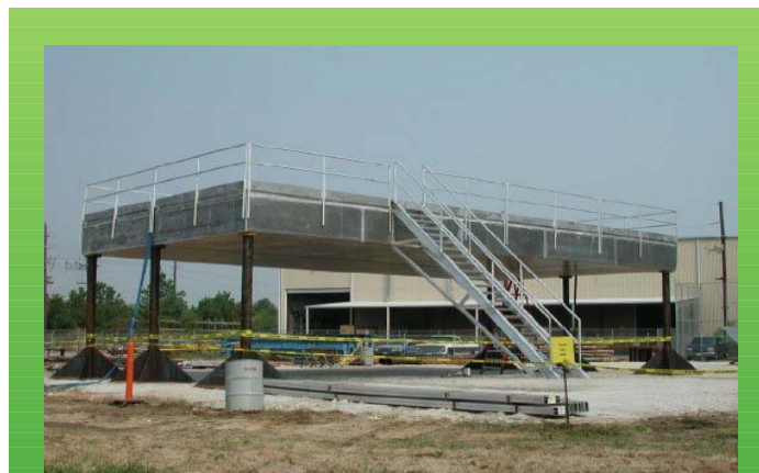
Figure 3. This drill platform is designed for ease of mobilization and demobilization to create a "disappearing well" when the platform is removed following drilling operations.

Texas A&M University, in conjunction with Maurer Technology and the Houston Advanced Research Center, in the fall of 2005 began a DOE-funded research project aimed at adapting new E&P technologies to reduce emissions to air and water. The goal is to incorporate current and emerging technologies into a clean drilling system with no or very limited environmental impact ( Figure 3 ). The project is geared to developing a viable ultralow-impact drilling system for use in exploration and exploitation of oil and natural gas in the United States, primarily the Lower 48 states.