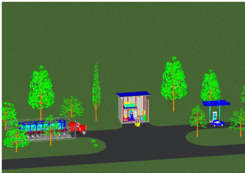
NETL's Hydrogen Research & Development/ Test & Evaluation Platform