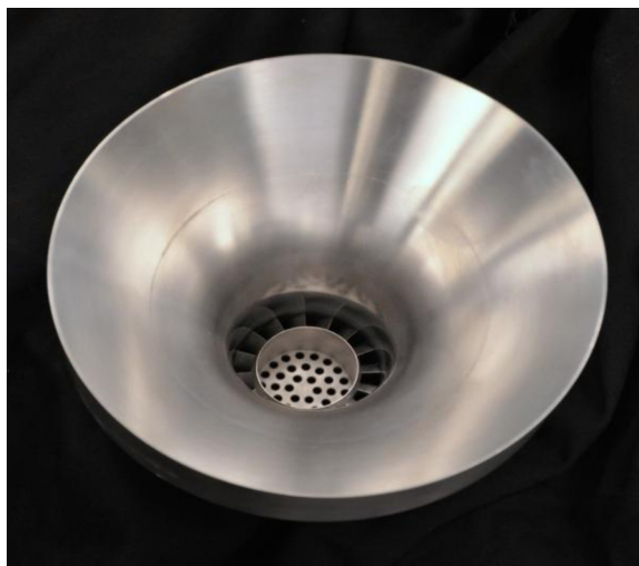
LSI with a modified flared nozzle (quarl).

potential of the LSI technology to meet the aggressive emissions and operational program goals.