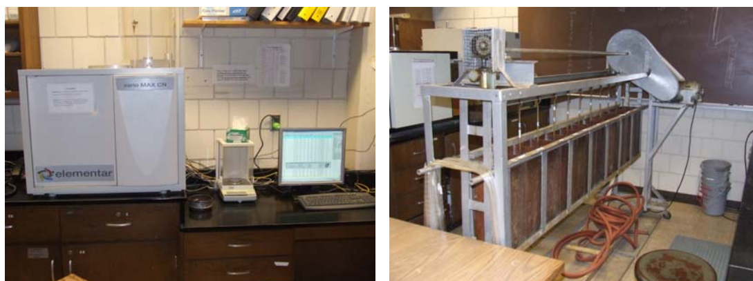
Figure 2. CN analyzer, for analyzing soil organic carbon and total nitrogen (left); Wet sieving apparatus for analyzing aggregate (right).

Three sites based on different parent material: Glacial Till (Coshocton), Till plain (Delaware), and Glacial Lake Plain (Henry county) located in Ohio, were selected to assess the historic carbon loss by cultivation. An additional 144 soil samples and 24 plant residue samples were also collected for measuring additional soil physical properties. Geospatial